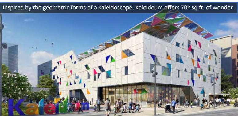
Inspired by the geometric forms of a kaleidoscope, Kaleideum offers 70k sq ft. of wonder.