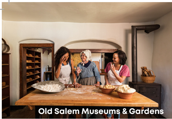
Old Salem Museums & Gardens