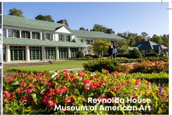
Reynolda House Museum of American Art