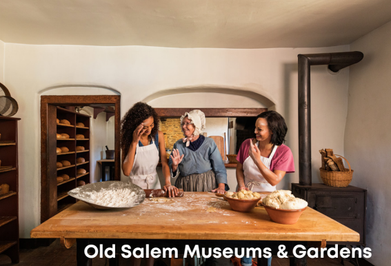
Old Salem Museums & Gardens