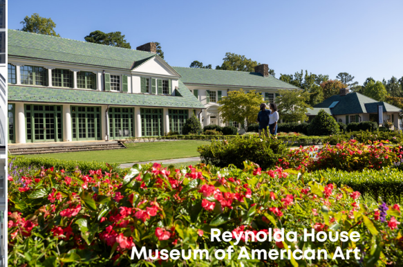
Reynolda House Museum of American Art